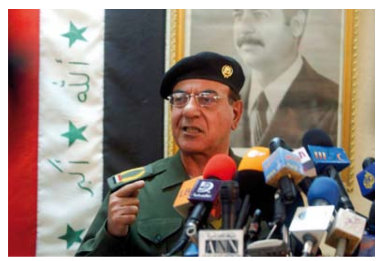
Bagdad Bob can tell you that black is indeed white.

3 Ten years later even the coolest looking Apple computer with all the gigabytes any human being could possibly want is still dumb.